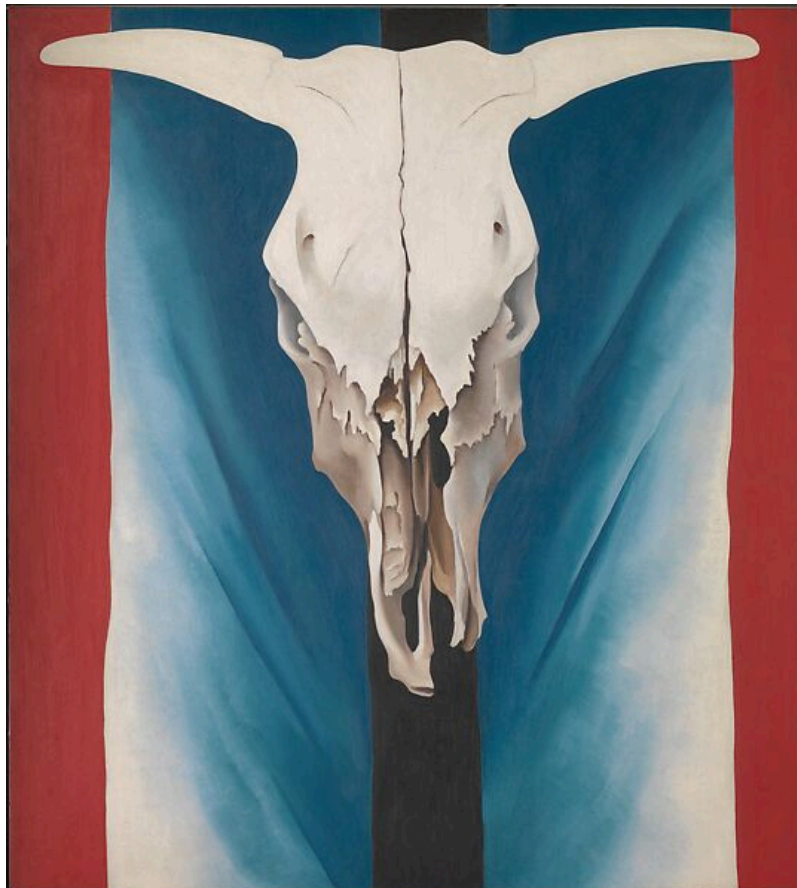
Georgia O'Keeffe (American, 1887–1986). Cow's Skull: Red, White, and Blue , 1931. Oil on canvas; 39 7/8 x 35 7/8 in. (101.3 x 91.1 cm). The Metropolitan Museum of Art, New York, Alfred Stieglitz Collection, 1952 (52.203)

“Anuario de Mission” June 25, 2022, https://pcusa.org/es/worship-with-us/yearbook/june-25-2022 .