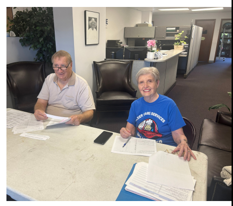
Many thanks to our wonderful volunteers who made the 2024 Independence Day Elder Care Meals on Wheels ministry a huge success!