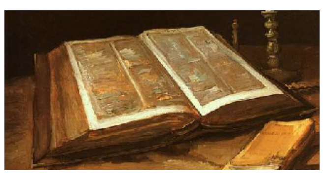
Sunday Festival Readings